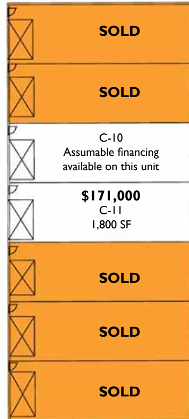
BUILDING C—Second floor